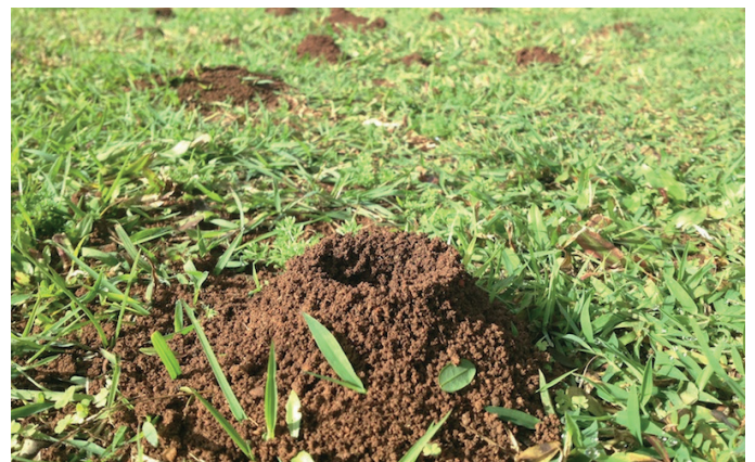
Funnel ant, nest destruction of lawn