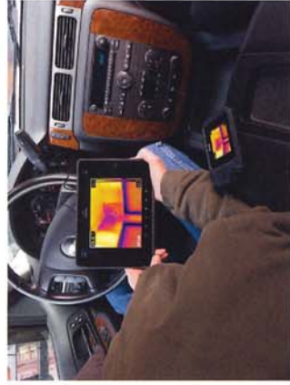
Upload images to FLIR Tools over Wi-Fi