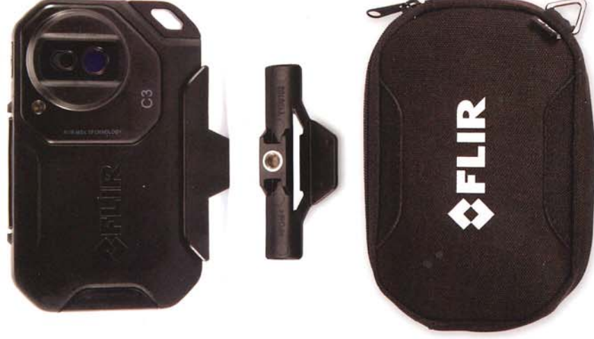
FLIR C3 with Tripod Mount & Carry Pouch

Specifications are subject to change without notice. For the most up-to-date specs, go to www.flir.com