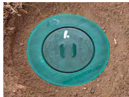
Picture 1: Sentricon RTI station correctly installed sitting flush with the soil surface, also shows station number.

In clay soil ensure the hole is deep enough to allow water to drain out of the Sentricon RTI station .