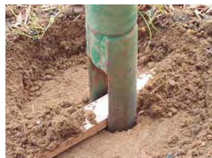
Picture 2: A piece of wood in the auger clearing the soil surface.